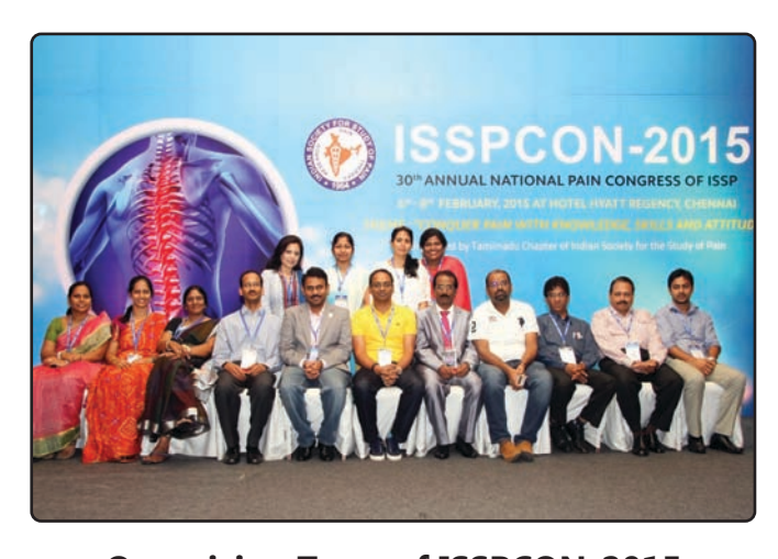
Organizing Team of ISSPCON-2015