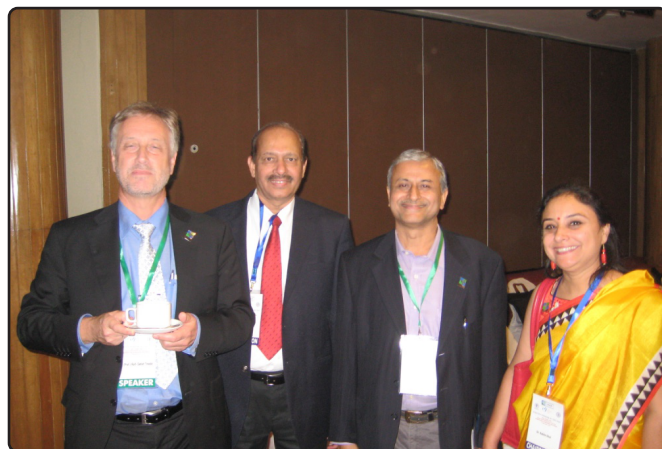
IASP & ISSP Presidents with some ISSP GC members