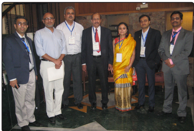
ISSP Governing Council