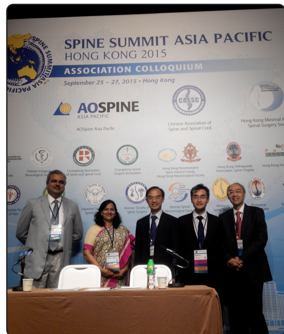
ISSP Participation with other society members