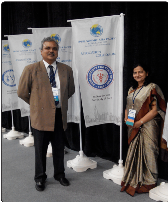
Participation from ISSP