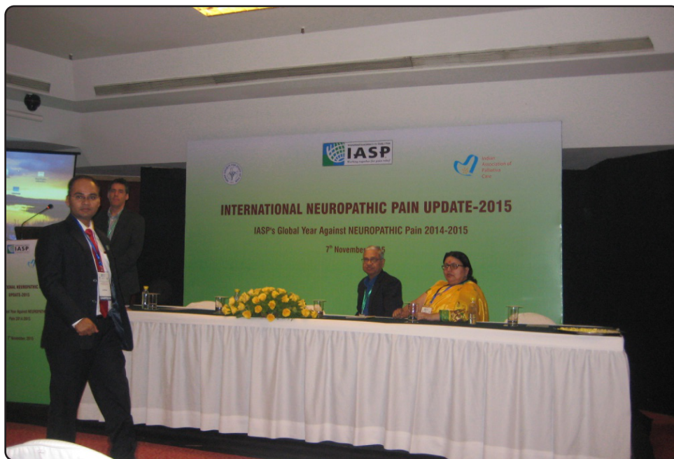
INPU-2015 session in progress