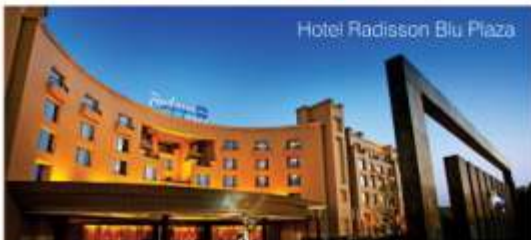
Hotel Radisson Blu Plaza

It gives us immense pleasure to invite you all for the 33rd Annual National Conference of the Indian Society for Study of Pain, ISSPCON 2018 scheduled from the 2nd to 4th February, 2018 at the "Radisson Blu Plaza Hotel", Mahipalpur, near Indira Gandhi International Airport, New Delhi, the Capital of India.